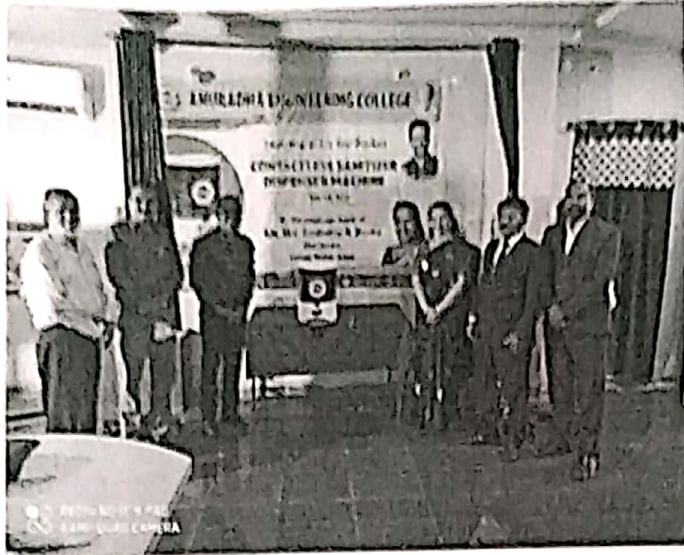
automatic sanitizer dispenser, assembled in the institute. Its launching programme.