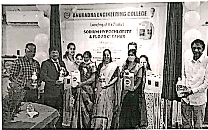
Sanitizer/ disinfectant, its distribution